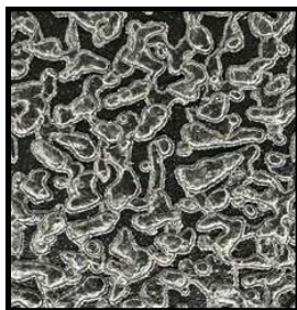
IP - Large Pebble