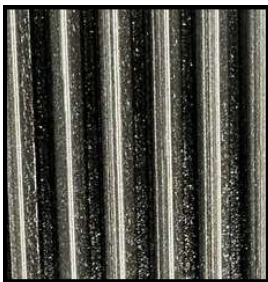
G- Longitudinal Groove