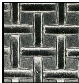
H - Basket Weave